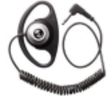
D-Shell RSM Earpiece