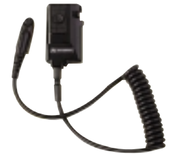
Ear Mic VOX/PPT Interface Module