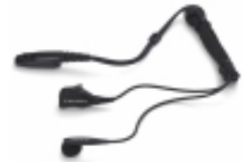
Earbud with combined Mic/PTT