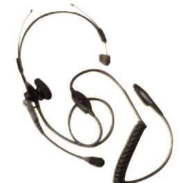
Lightweight Headset w/Boom Mic and in-line PTT