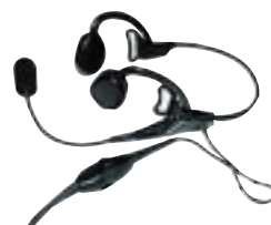
Temple Transducer Headset