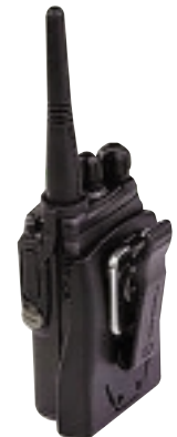
Plastic Carry Holder w/Belt-clip