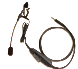
Ultra-Light headset w/Boom Mic and in-line PTT