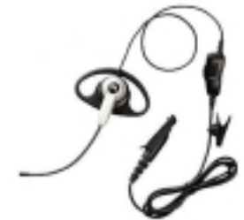
D-Style Earset with Boom-Mic