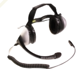
Racing Headset - Heavy Duty