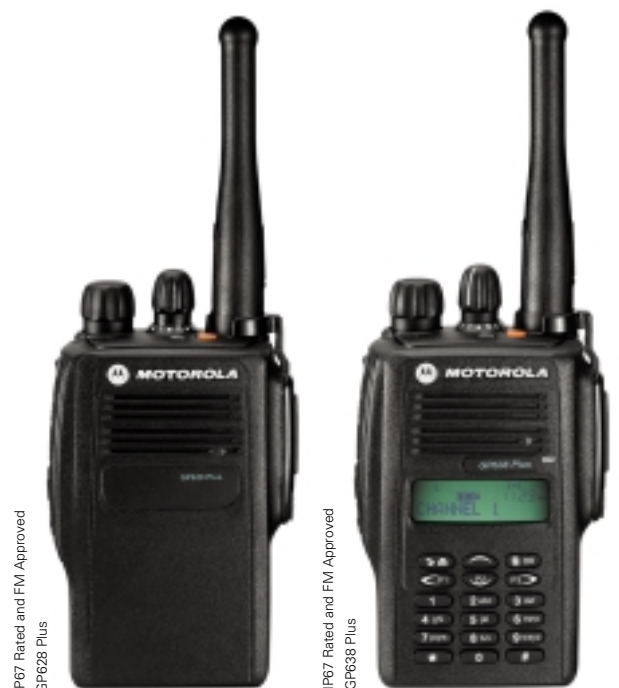
IP67 Rated and FM Approved GP628 Plus

Lightweight and compact, Motorola’s smallest professional two-way radios have received Factory Mutual (FM) Approval and meet Military Standards (MIL) 810C, D, E and F.