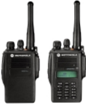
IP67 Rated and FM Approved GP628 Plus and GP638 Plus

* Dust-tight and water submersible are tested as per criteria in IEC (International Electrotechnical Commission) 60529 IP67