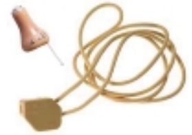
Wireless Discreet Earpiece

The following Surveillance Kits Requires PMLN4455 Adapter which attaches to the Radio. They are compatible with NTN8370 and NTN8371. The 2-W and 3-W kits are compatible with the RLN4922.