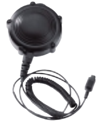
Remote Body PTT Switch for Ear Mic