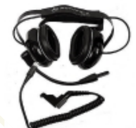
Heavy Duty Noise Cancelling Boom Mic w/ PTT Earcup